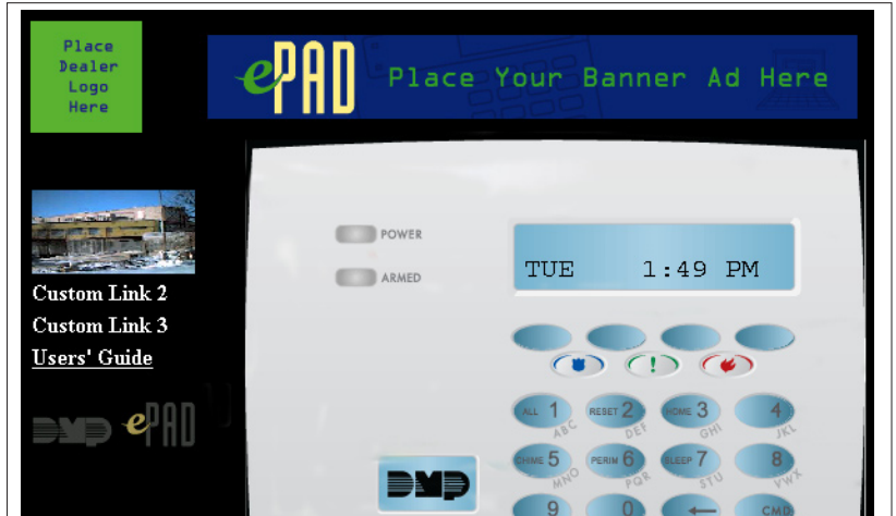
Figure 2: Sample of how the ePAD could look on the screen

You may also press the keys on the keyboard that correspond to the keys on the ePAD. Press the digit keys (0 through 9) as you would on a standard keypad. You can also use the number pad and the numbers on the top of your keyboard to enter information. Be sure that the Num Lock is set to use the number pad.